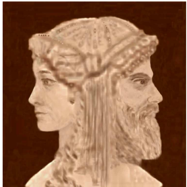
Janus as Hermaphrodite

January takes its name from the Roman God, Janus, who, with two faces looks both ahead to the new year and back on the old. Janus was the god of doors, doorways, gates and beginnings and endings.