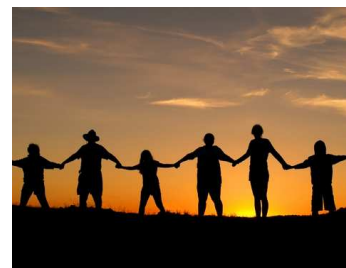
Trust the Dawning Future

The CUC ACM material is now available at the CUC web site, www.cuc.ca , and click on the conference poster.