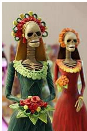
Catrinas (Elegant Skulls)

The Mexican holiday is coincident with the Catholic holidays of All Saints’ Day on November 1 and All Soul’s Day on November 2. The celebrations in various cultures focus on gatherings of family and friends to pray for and remember friends and family members who have died. European celebrations probably trace back to pagan observations such as the Celtic Samhain or New Year celebration when the veil between the worlds was very thin and the departed souls could cross over to the next plane. The Mexican holiday traces its origin to an Aztec festival dedicated to the goddess Mictecacihuatl. In Brazil, the festival