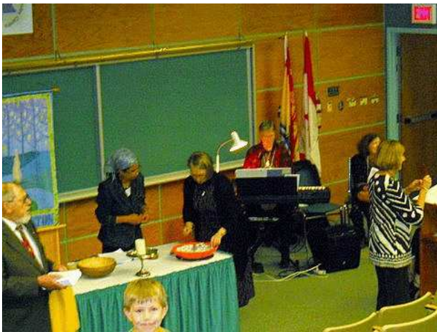
Sunday Worship Service Preparation